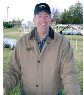
Judge Alan Arthur